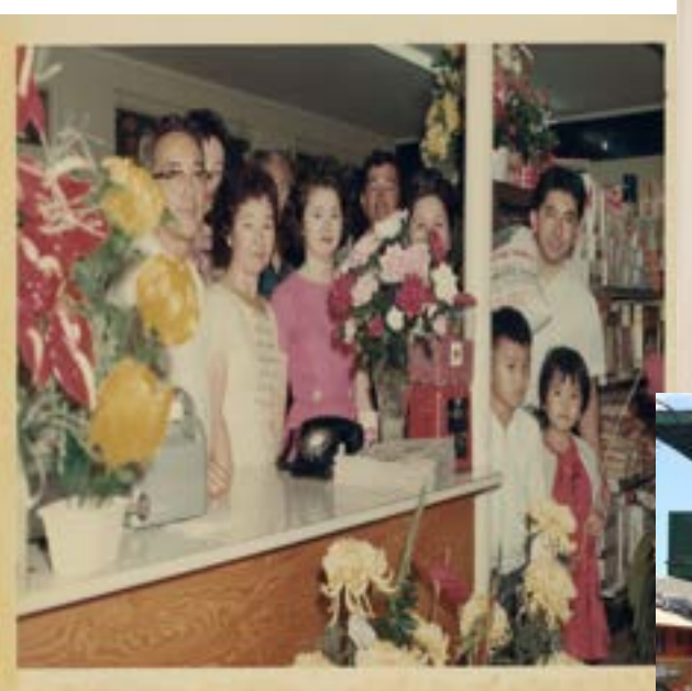
Grand Opening of Kaohu Store 1967